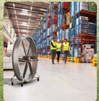
Logistics and Storage