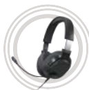
Lenovo Ideapad Gaming H100 Headset