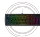
Lenovo Legion K310 RGB Gaming keyboard