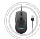
Lenovo M210 RGB Gaming Mouse