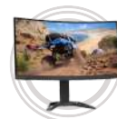
Lenovo Legion Y27h-30 Monitor