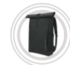
Lenovo Ideapad Gaming Modern Backpack