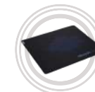
Legion Gaming Control Mouse Pad XXL