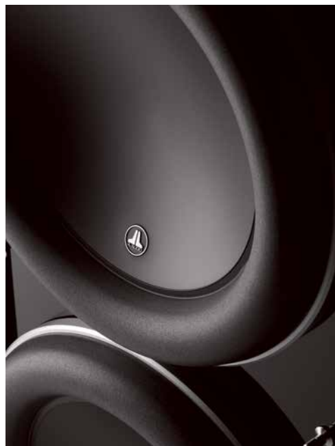
Audiophile pressure: What the optimally calibrated Gotham V2 delivers in terms of consistent low bass is out of this world.

This subwoofer can improve EVERY loudspeaker. The room becomes bigger, the playback effortless.