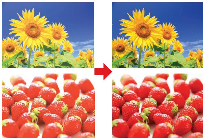
Predecessor Canon Product without V 2 Color Technology