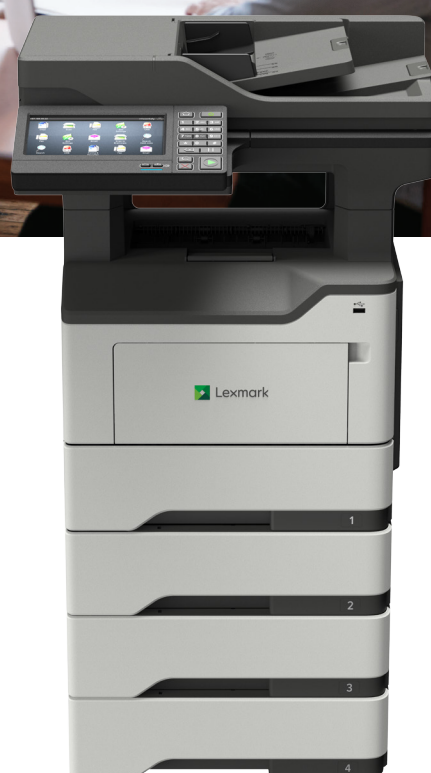
MX622adhe with optional trays