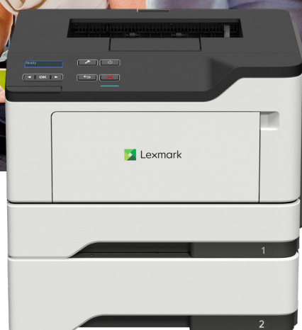
B2442dw with optional tray