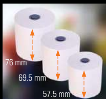
Variable Paper Width