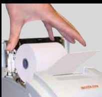
Easy Paper Loading

For maximum efficiency, the SRP-275 offers drop-in paper loading and the users can easily change the paper with one-hand. At the same time paper width guide allows you to use 57.5 ± 0.5mm, 69.5 ± 0.5mm, or 76 ± 0.5mm paper rolls for more flexibility and greater cost savings.