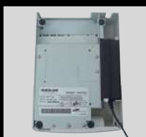
Built-in Power Supply

The 220V AD adapter is elegantly integrated into the compact printer housing. Consequently, messing around with cables is avoided which is ideal at space-limited POS terminals or highly frequented cash desks.